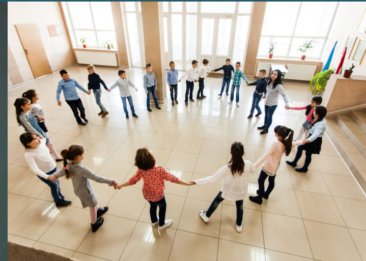
Incorporate movement into or between lessons