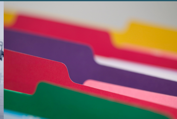
Use color coding & folders