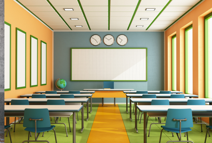
Create user-friendly desk arrangement