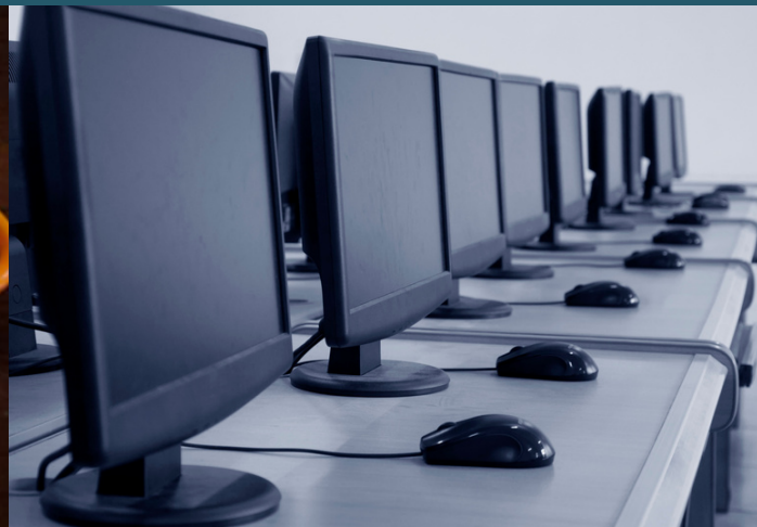
Turn off technology when not in use