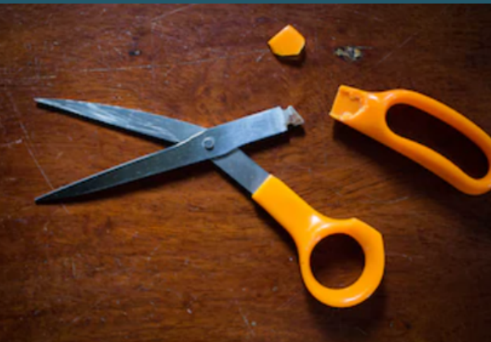
Toss out broken or unused material