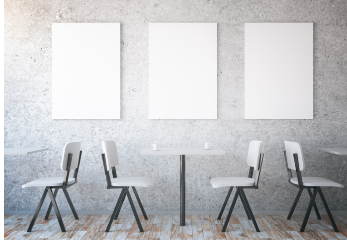
Use wall space purposefully and avoid clutter