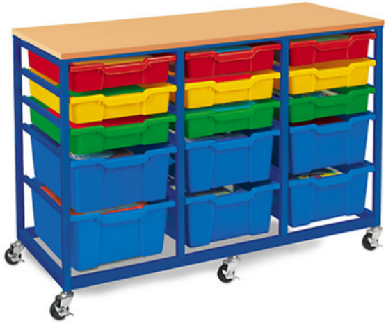
Keep things organized