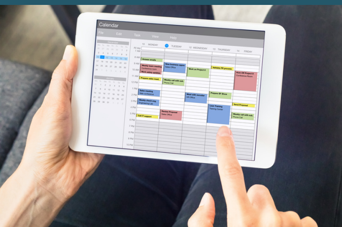
Stick to routines and schedules