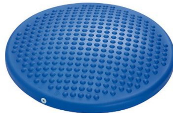
Allow nondistracting fidgeting