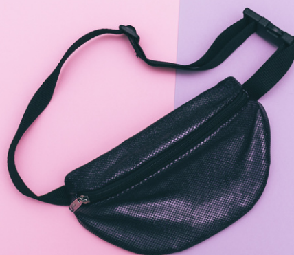
Allow weighted materials (such as a fanny pack or backpack)