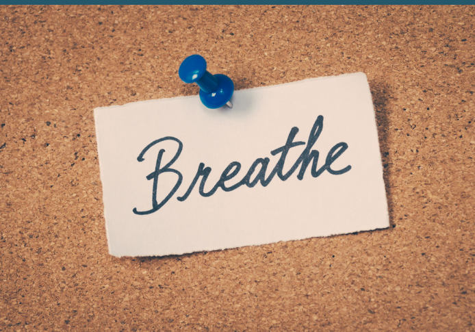
Teach calming strategies