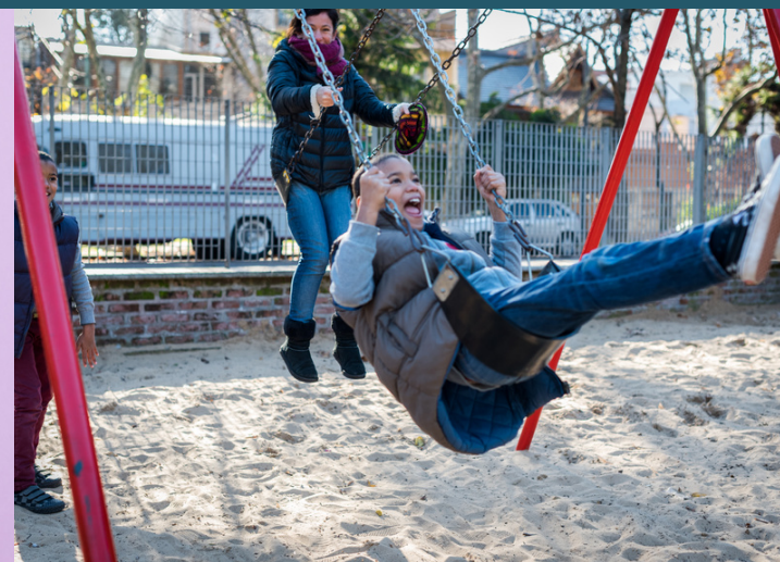
Offer breaks for whole-body movement