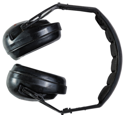
Offer noise-cancelling headphones