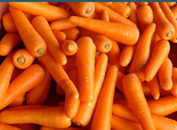
Offer crunchy snacks