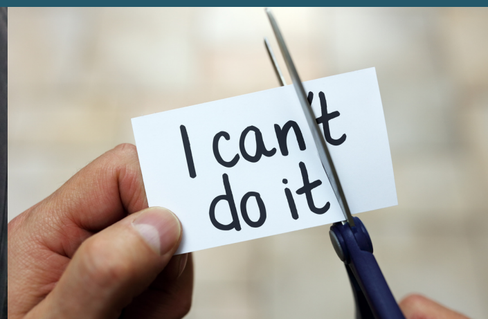
Encourage positive self-talk