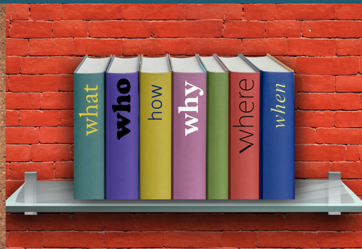
Engage the "thinking" brain