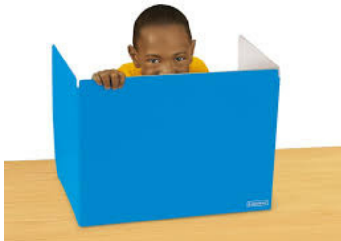
Use privacy shields